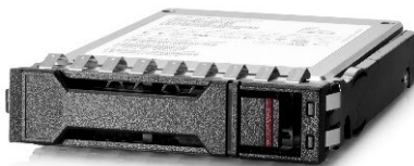
Basic Carrier (BC)