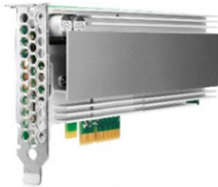
PCIe Add-in-Card (AIC)