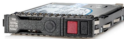
Smart Carrier NVMe (SCN)