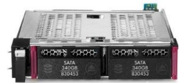
Smart Carrier M.2 (SCM)