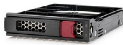
Low Profile Converter (LPC)