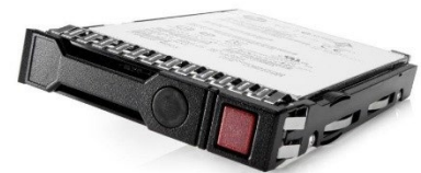
Smart Carrier (SC)